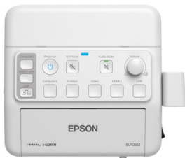
PowerLite Pilot 2 AV Control Box

OR, add-on the below two products at no charge - a $438 value!**